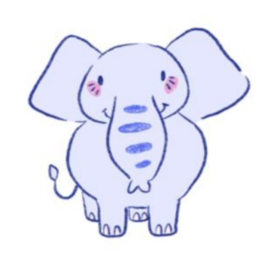
Word of the month